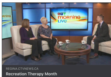
REGINA, CTVNEWS.CA Recreation Therapy Month

To build excitement, create awareness and celebrate TR Professionals during TR Awareness Month in February 2020, S.A.R.P. leveraged the media, a contest and social media.